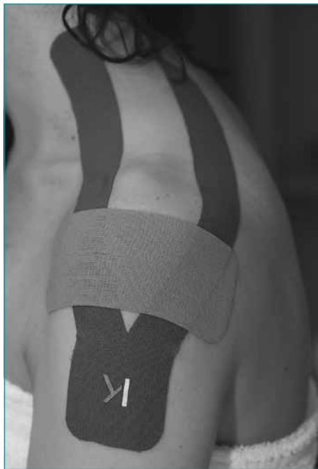
Figure 3 Application of KT for the deltoid, reinforced by a transverse strip.

Abbreviations: KT = Kinesio taping; ROM = Range of motion; WAD = whiplash-associated disorders.