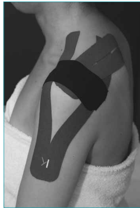
Figure 4 Application of KT for rotator cuff tendonitis/impingement.

There is limited research evidence pertaining to the effect of KT on strength. Slupik et al. 37 reported an increase in EMG activity of the vastus medialis after 24 hours of wearing kinesiotape in nine healthy, active individuals. Gonzalez-Iglesias et al. 38 used KT to treat patients with whiplash-associated symptoms (Figure 5) and reported a 23% reduction in neck pain immediately after kinesiotape application and improvement