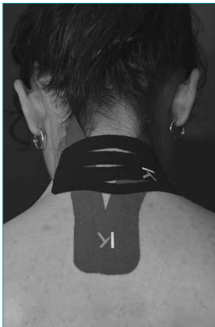
Figure 5 Application of KT for the cervical spine.

Not all studies have reported beneficial effects for KT. Briem et al. 59 recently reported that KT had no effect of activation of the peroneus longus muscle. Chang et al. 40 reported that KT had no effect on grip strength in healthy collegiate athletes. Fu et al. 41 reported similar findings for quadriceps strength. Chang et al. 40 postulated that an observed enhancement of grip force sense associated with KT may have been due to an effect on mechanoreceptors that facilitated the response to alteration in the length and tension of the muscle fibers. Such an effect may be beneficial to athletes who compete in sports that may require precise hand force control. 40 Firth et al. 42 examined the effect of KT on hop distance, pain, and motoneuron excitability in patients with Achilles tendinopathy and healthy individuals. KT of the Achilles tendon facilitated activation of the soleus and astrocnemius in healthy subjects after removal of the kinesiotape, but the effect was not observed for those with Achilles tendinopathy. Furthermore, KT did not have a significant effect on hop distance or pain.