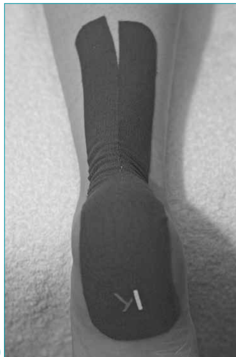
Figure 2b Convolutions following KT application when the foot is in a neutral position.