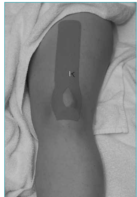
Figure 1 Application of KT for the anterior knee and thigh.

Kinesio taping as a fascial unloading technique shows promise and warrants further investigation.